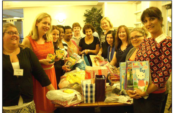
Pictured are some of the JLY members who donated school supplies for Harding Elementary.